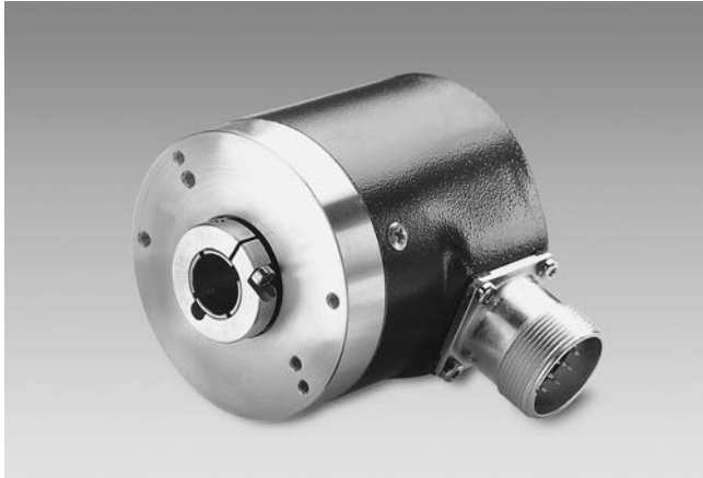
GBM2H with through hollow shaft