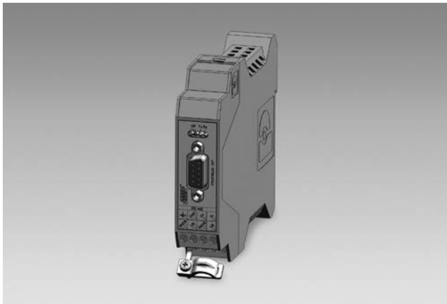
GK473 with Profibus-DP interface