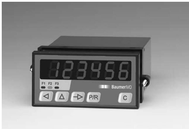
TA201 - LED-Tachometer