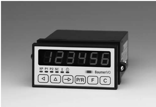
NE218 - LED Preset counter