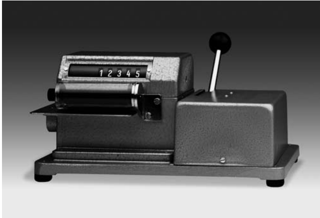
FD270 - Impulse counter