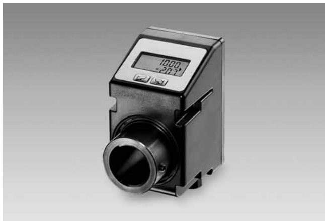
N 142 with cable output