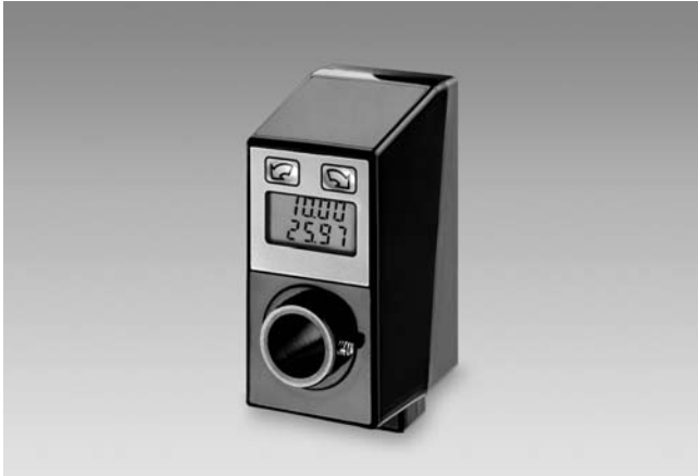
N 152 with cable output