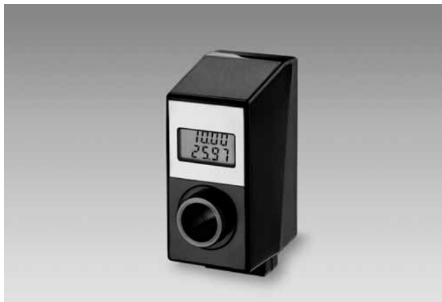
N 150 with connector output