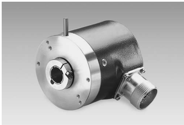
GBP5H with hollow shaft