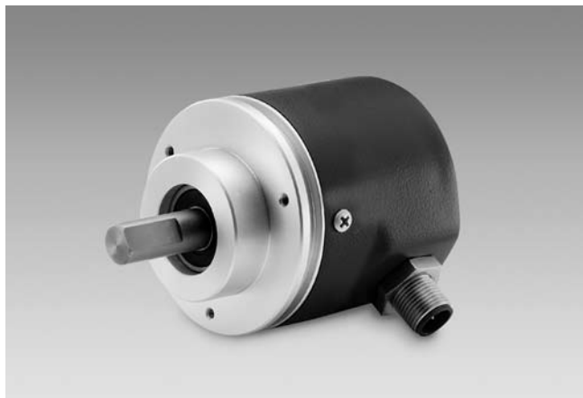
GXP8W with clamping flange