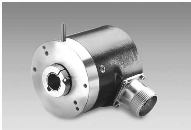
G0P5H with hollow shaft