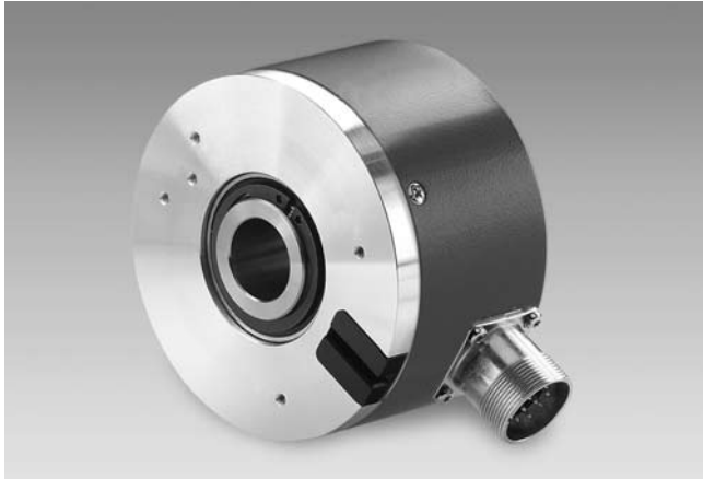
G1S2B with hollow shaft