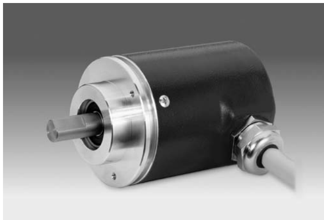
GXN1W with clamping flange