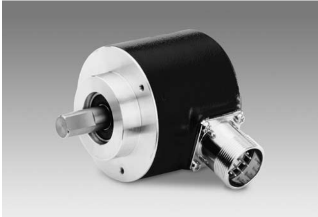
GA210 with clamping flange