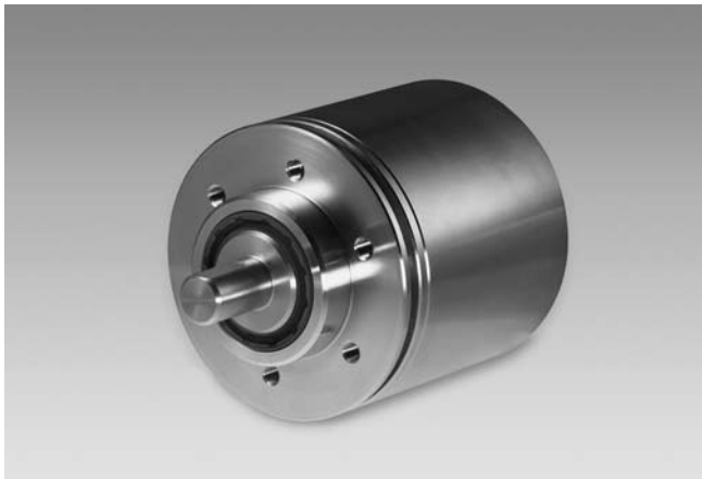
X 700 with EX-proof housing