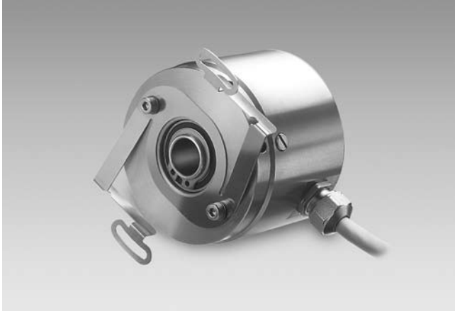
GE333 with hollow shaft