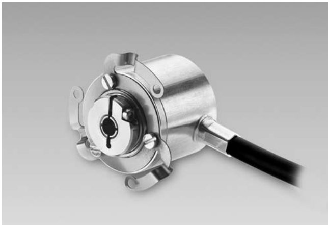
GI321 with end shaft