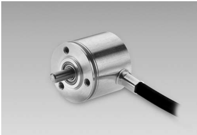
GI320 with shaft