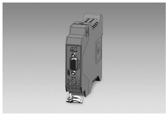
GK473 with Profibus-DP interface